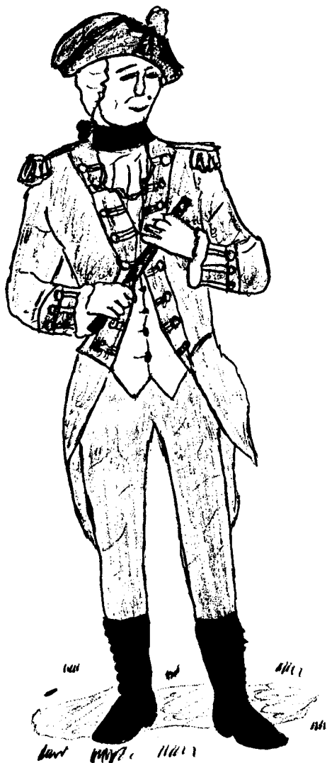
Fife de la Guerre d'Indépendance américaine.

Ces groupes, dits "Corps", continuèrent à conserver les répertoires anciens. Ce style "Ancien" faillit totalement disparaître après un déclin important et la précipitation des Etats-Unis d'Amérique en 1941 dans le conflit de la seconde guerre mondiale.